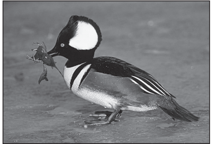
Male Hooded Merganser